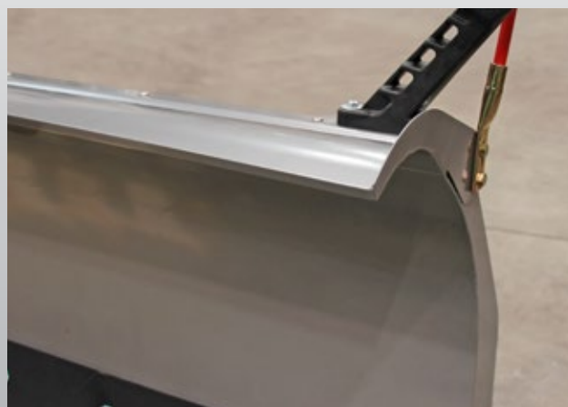
Optional snow deflector in steel (straight-blade)