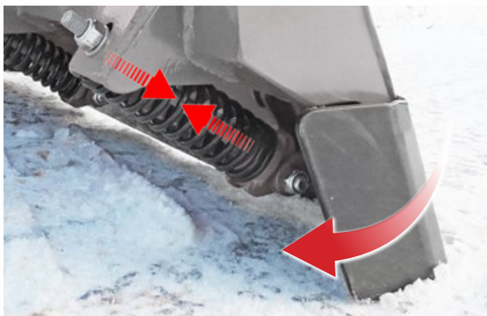
Cutting edge with trip springs