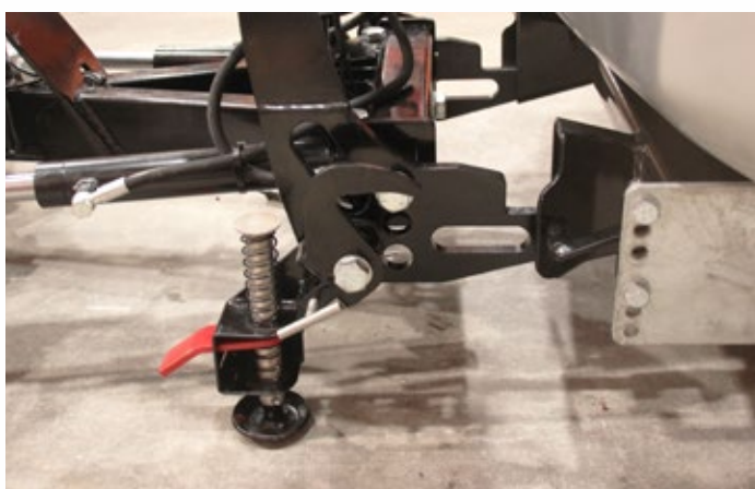
Quick hitch - lift shoe handle to attach your plow to the vehicle.