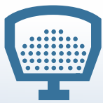
STANDARD Salt & sand

The hopper construction can easily be transformed into a complete brine solution sprayer or into a pre-wet combi spreader that moistens the spreading material. Integrated tanks in the double-walled hopper body holds up to 450 l of liquid. The spreader can optionally be equipped with a 2 meter spray bar or a hose reel with hand-held spray nozzle.