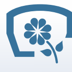
OPTIONAL Summer/garden use