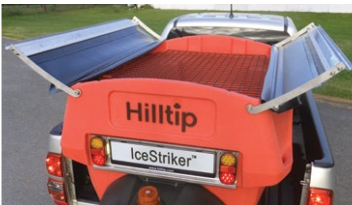
Two-piece tarp mechanism and top screen