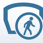
OPTIONAL Hose reel