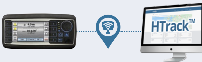
The optional HTrack™ program transfers spreading data via mobile network

Track and manage all of your spreading devices and snowplows online on your computer, tablet or smartphone. The program shows treatment route on map, and spreading details like speed, GPS location, material used etc. With HTrack™ you can keep track of your expenses and get de-icing performance evidence for slip and fall injury claims. The spreading data can be summarized and generated as PDF reports.