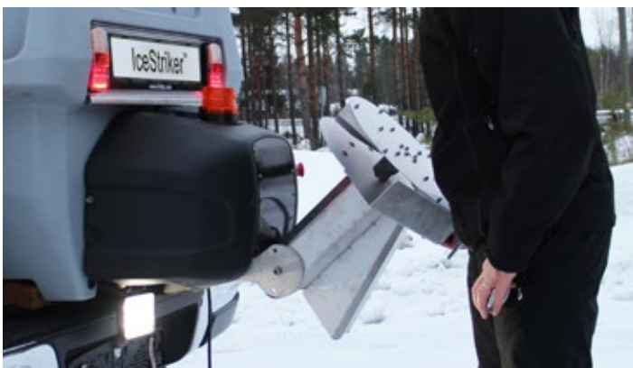
Stainless steel flip-up chute, designed for spreading salt with high humidity