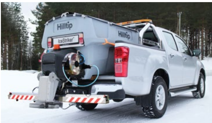
Optional spraybar and hose reel